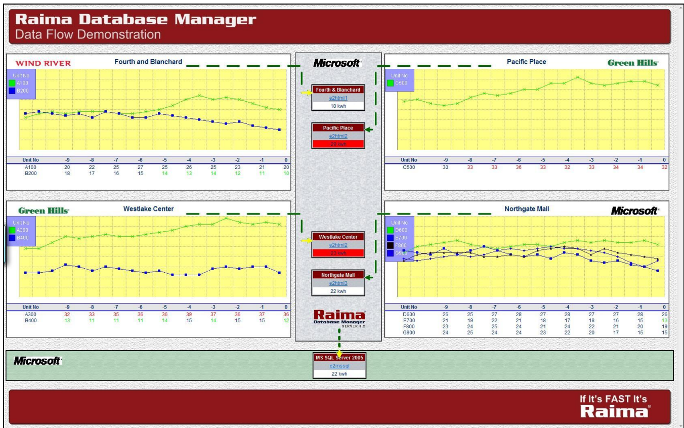
The above screenshot shows how the 5 different web servers are aggregated into a single view.

On the RDM Server side, all transactions picked up by the replication clients are translated into SQL insert statements and aggregated into the RDM Server database using the native SAG CLI API. The RDM Server database can be accessed by any SQL tool, but for our purpose we expose the data in near real-time using PHP and the Apache WEB server. All insert transactions created by processing data in the replication clients are also picked up by a transaction plug-in, which in our implementation, translates them into ODBC calls to the instance of Microsoft® SQL Server® 2005 Express server. These calls insert the data into the SQL Server database. Finally, on the Microsoft® SQL Server® side of the system, an internet information server is hosted exposing the data through ASP.Net.