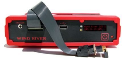
Figure 1: Wind River ICE 2

Wind River ICE 2 was designed in concert with today's leading SoC vendors. Through its tight integration with the debug port on the industry's leading 32- and 64-bit single core and multi-core SoCs, Wind River ICE 2 provides developers with direct access and control of their target device under development or test. Having this control means that developers will have access to status information for their target at all times, regardless of its operational condition. Since Wind River ICE 2 leverages the debug control block of the microprocessor, it is not dependent on an operating system to work and it can provide the developer with target access even when there is no operating system running on the target.