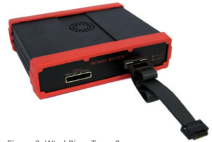
Figure 3: Wind River Trace 2

Wind River ICE 2 is fully integrated with the Wind River On-Chip Debugging API, allowing fast and flexible integration of ICE 2's powerful capabilities into your own custom environment (e.g., automated test and production application). Wind River On-Chip Debugging API comes with complete and intuitive documentation, so developers can take full advantage of its features and benefits.